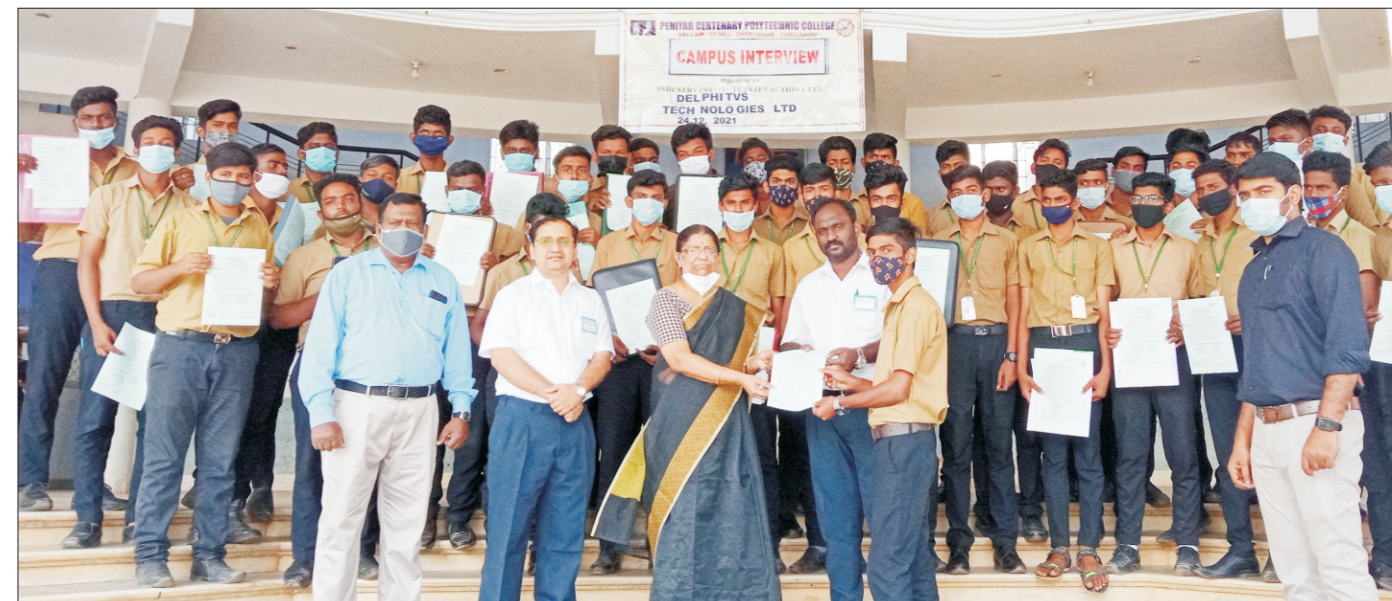
Our Principal issues offer letter to the selected students in the Campus Interview organised in association with DELPHI-TVS, Chennai on 24.12.2021