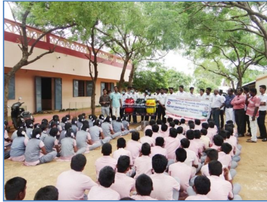
Solid Waste Bins (3 Nos) for Recycling Purpose were Donated to Government Higher Secondary School, Alagudi