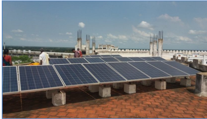
Cleaning of Building Terrace