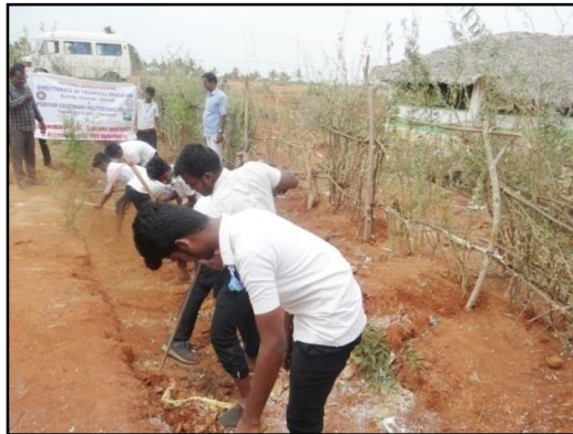
NSS Volunteers give demo for Segregating Biodegradable Waste which is used to make Composite Pit among the Villagers