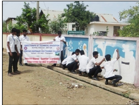
Painting on the Wall