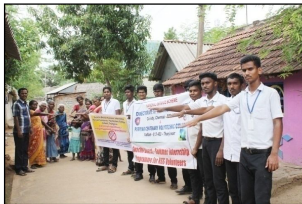
Pledge taken by Villagers on Plastic-free zone