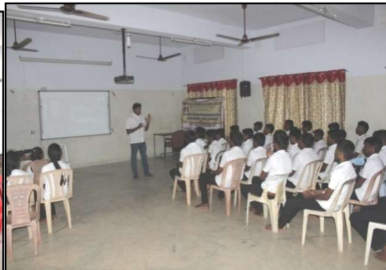
Communication Skill and Management(ECE)