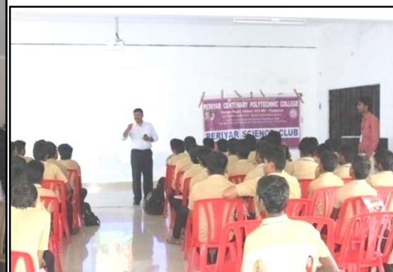
How to become an Entrepreneur (ECE)