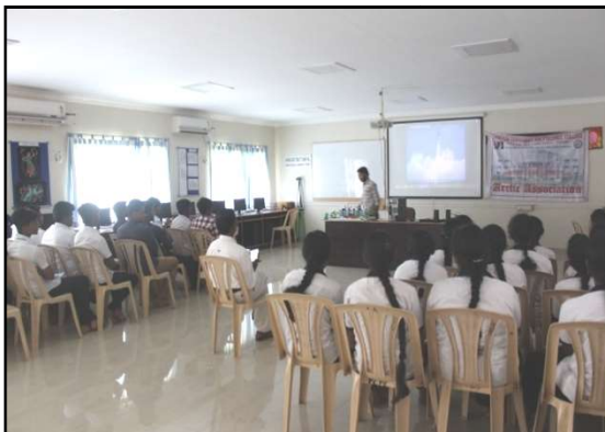
Embedded System (EEE)