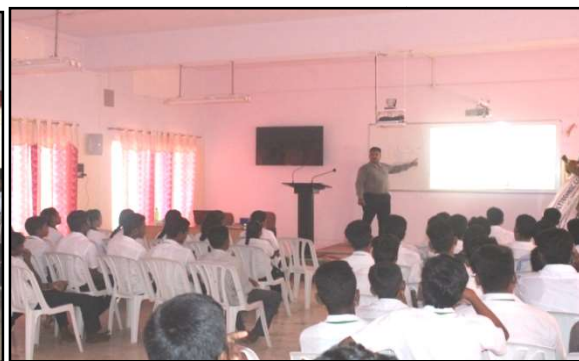
BIG Data (CT)