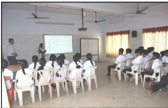
Personality Development (ECE)