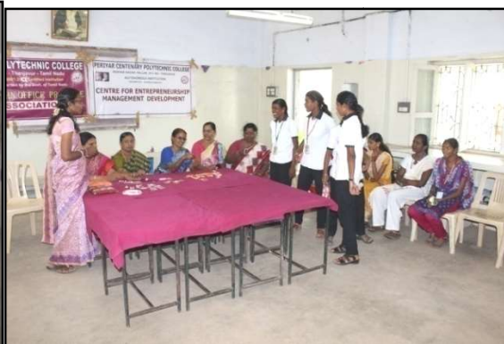
Skill Development in hand work (MOP)