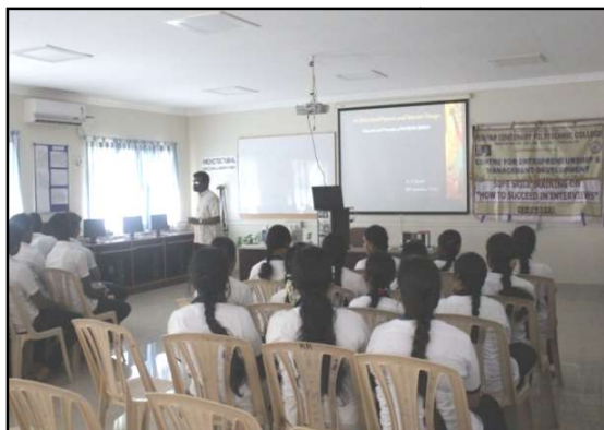
In-Plant Training Awareness Programme(ARCH)