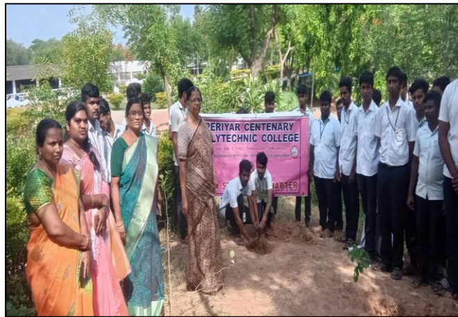
Tree plantation on 03.06.2022