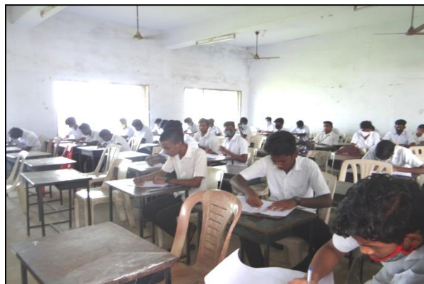
Drawing competition on 06.06.2022