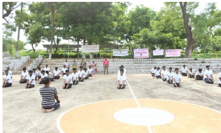
YOGA Day Celebration