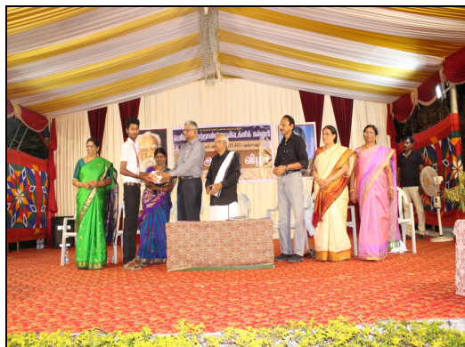
BEST STUDENT AWRD