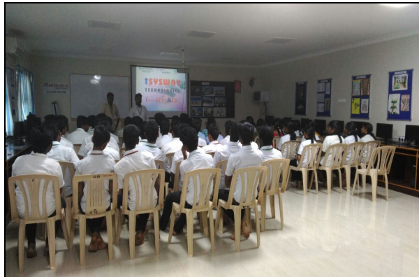
DEMO PROGRAMME - "SOFTWARE COURSE"