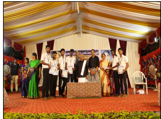
BEST PROJECT AWRD