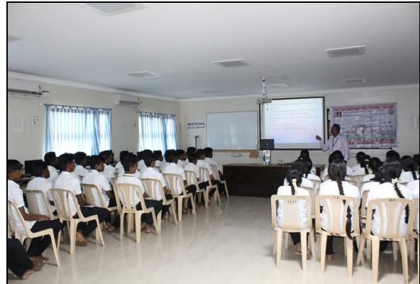
RECENT TRENDS IN ENVIRONMENTAL ENGINEERING