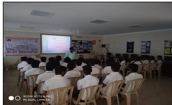
PROFESSIONAL PRACTICE AND PROJECT MANAGEMENT